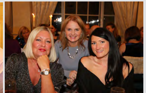
Above: Members and their Guests enjoy the reception and dinner