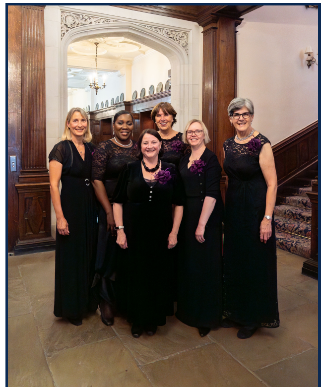
The Military Wives Choir at the Charitable Trust Dinner July 2023.

The Human Resource Professionals Charitable Trust is a CIO registered organisation with the Charity Commission with the registration number 1183708