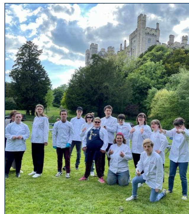
Young bakers from Jubylee Bakes are recognised for their quality produce.

A key driver in Trustee decision-making is to uphold high standards of Diversity, Equity, and Inclusion and to ensure that investment strategies are compliant with Environmental, Social, and Governance (ESG) principles. To this end, grants have been made to diverse charities that might not attract funds from larger organisations. Here are some of the organisations that have been supported by the Trust covering employability, social mobility, neuro-diversity, and Severe learning difficulties.