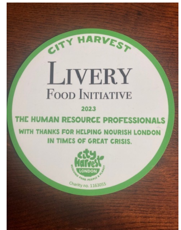
Recent Awards to the HR Company

Thank you for considering how to support the Human Resource Professionals in our journey to deliver more to beneficiaries and to achieve the ultimate accolade for our profession that of elevation to The Worshipful Company of Human Resource Professionals.