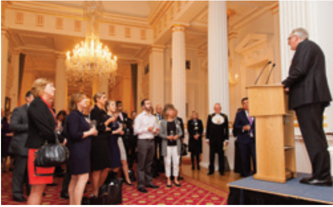
The Mansion House on 15th April 2015 An Introduction to HR Guild Life

The HR Guild Installation on 23rd June Post-Installation Celebration in the gardens of The Tallow Chandlers Hall